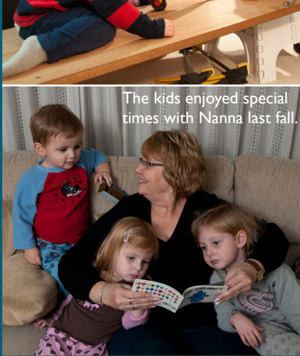
The kids enjoyed special times with Nanna last fall.