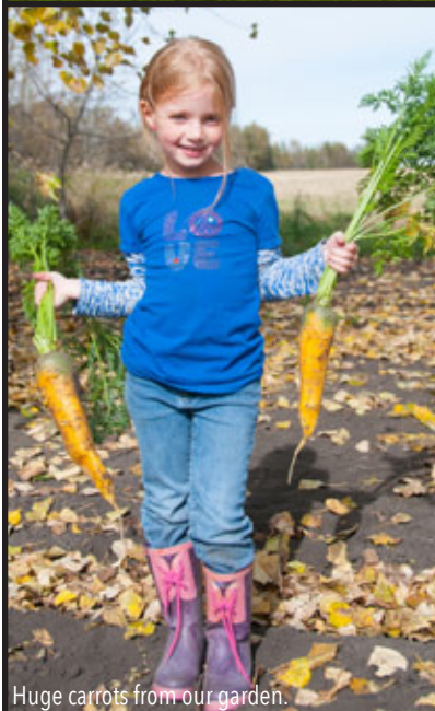
Huge carrots from our garden.