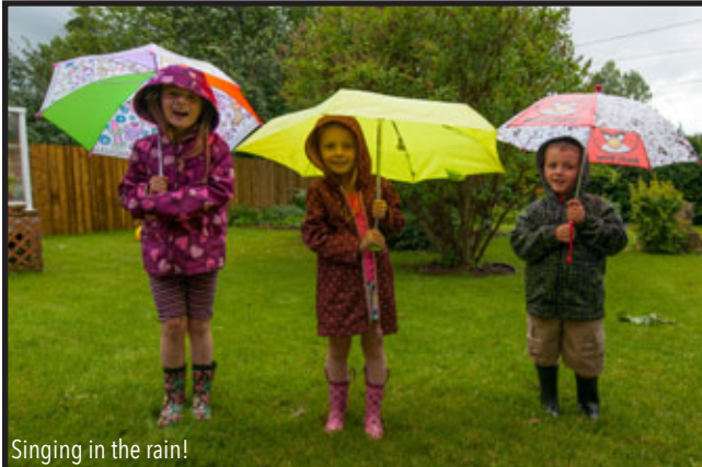
Singing in the rain!